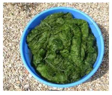
Bowl of blanketweed

This product has solved the weed problem for me and I shall continue to use it on an ongoing basis. If trying for the first time I suggest that you test your water for nitrate and phosphate regularly to check the reduction in levels.